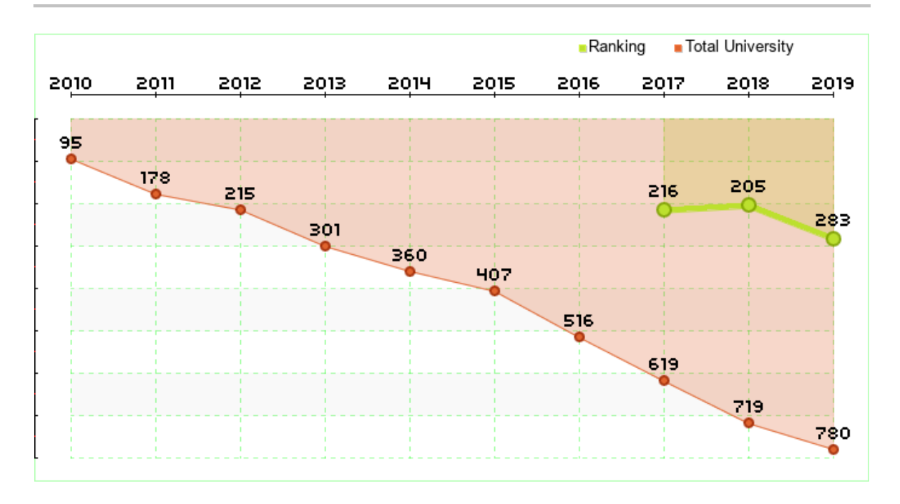
Figure 3.1 World Rankings History Diagram